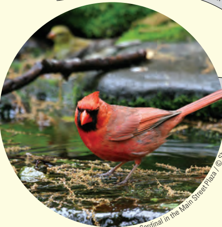
Cardinal in the Main Street Plaza