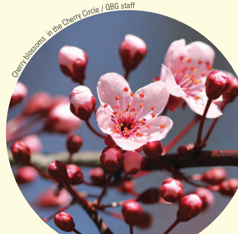
Cherry blossoms in the Cherry Circle