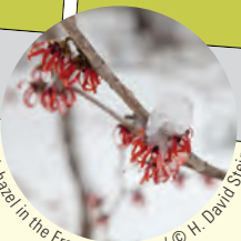
Winter hazel in the Fragrance Walk