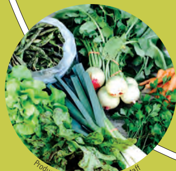
Produce from QBG Farm / QBG staff