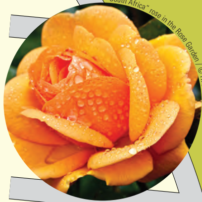
"South Africa" rose in the Rose Garden