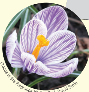
Crocus in the Fragrance Walk