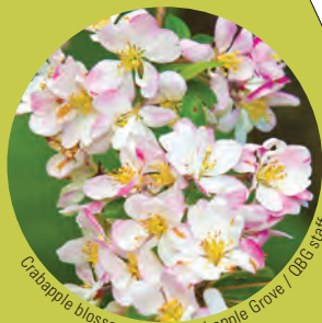
Crabapple blossoms in the Crabapple Grove / QBG staff

Queens Botanical Garden is a living museum, a place of peace and beauty for the quiet enjoyment of our visitors. Please respect all living things within our gates—plants, birds, insects, wildlife, and people.