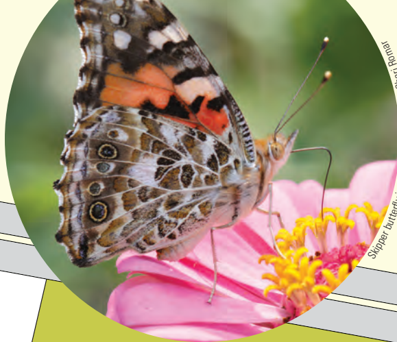
Slipper butterfly in the Annual Garden