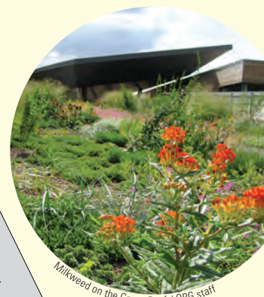
Milkweed on the Green Roof