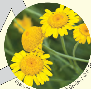
Dyer's chamomile in the Herb Garden